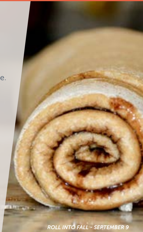
ROLL INTO FALL - SEPTEMBER 9

You are safe here. Take a breath and look around you. We may appear like we have it all together, but we struggle in some of the same areas as you. We are a community of grace, mostly because we all need a little grace and peace in our lives. Grace is here because Jesus is here.